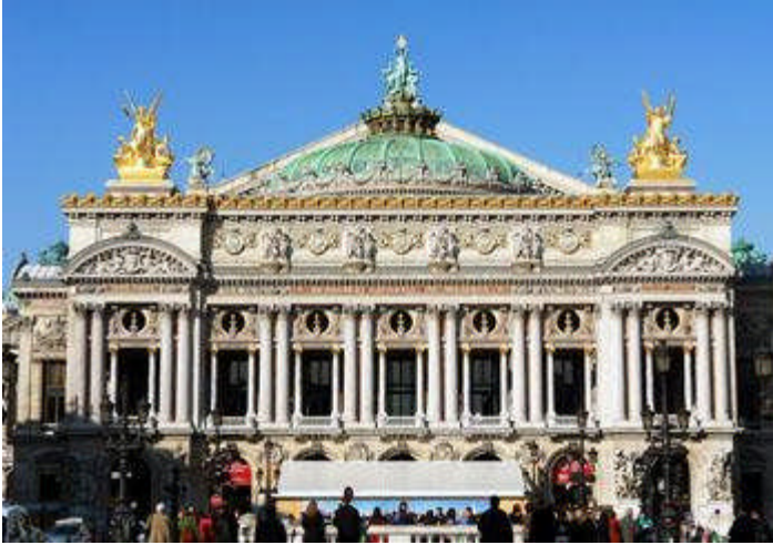
Showcasing the Neo-Baroque style, this 2200 seat Paris Opera, built in 1875, is regarded as an architectural masterpiece of its times.

colors in its cultural palette as there are textures in its wine. Since the Middle Ages, France has been the nursery of exceptionally talented artists, be it painters such as Cezanne, Degas, Renoir, and Claude Monet, or sculptors like Jean Goujon, Germain Pilon, and Auguste Rodin. With their unparalleled intellect and power of reasoning, French philosophers and thinkers like Descartes, Rousseau, Voltaire, and Sartre have been a beacon to the world.