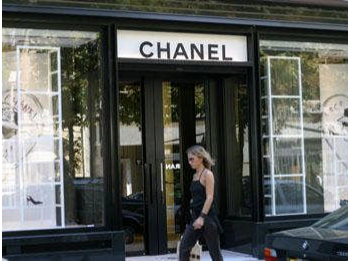
Acclaimed as the fashion capital worldwide, France seems to have the last word in haute couture .

The personal services industry, which provides a wide array of family and health-care services, is one of the fastest-growing sectors in the French economy. It is also one of the largest employers in the country. Companies operating in this space are expanding globally, leveraging France's stature as a universal benchmark for standard of living.