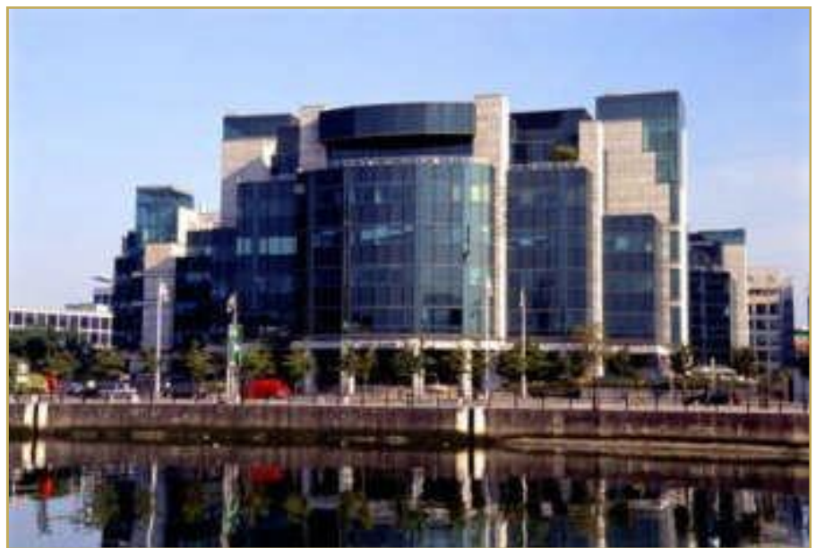
The newly built Financial Services Center in Dublin stands on the banks of the River Liffey. Ireland is bouncing back after the financial meltdown, which led to its bailout by the International Monetary Fund and the European Union in 2010.

However, the elections turned in a fractured verdict with no party getting an absolute majority in Parliament. The center-right Fine Gael, which won the maximum number of seats, has struck a deal with the center-left Labor Party to form a coalition government. Fine Gael leader Enda Kenny has been selected to take over the country's reins shortly. Kenny's first task at hand will be to press for some leeway regarding the rigid terms imposed by the country's €85 billion bailout by the EU and the IMF, especially a lower interest rate. At the upcoming EU summit, Kenny may come under pressure to raise Ireland's corporate tax rate, which currently stands at