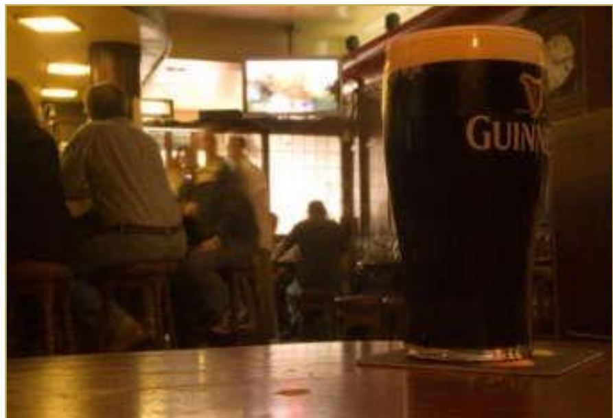
The ubiquitous Irish pubs serving Guinness draught are enduring symbols of Irish social life and culture. The eponymous pubs now dot some of the most happening cities around the world.

“Unity in Diversity”, the phrase often used to describe India's multi-cultural identity, could well be applied to Ireland too. Differences abound between city dwellers and the rural population, Catholics and Protestants, the English-speaking majority and the Irish-speaking minority. But there are certain aspects that unite Ireland like its history, fables, magical legends, music, and drinks. Leprechauns, Yeats, Guinness, Celtic music and dancing are