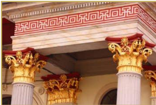
The Warsaw Stock Exchange, which had its humble beginnings in 1991, currently has a market capitalization of €113 billion and a daily turnover of about €680 million.

Coal is the most abundant, as well as the cheapest fossil fuel in Poland, and is used predominantly for power production and energy generation in the country. Though not richly blessed with oil resources, Poland is home to a major European oil refiner, as well as a petroleum retailer who has the distinction of being Central Europe's largest publicly traded company. In the metals and mining sector too, Poland touts the second largest producer of silver and the sixth largest producer of copper in the world, exporting the world over. The country is also a pioneer in organic agriculture and a leading exporter of milk, meat, fruits and vegetables to EU members. In addition, Poland boasts of a globally recognized and flourishing yacht building industry, and is a favored destination for health tourism in Europe.