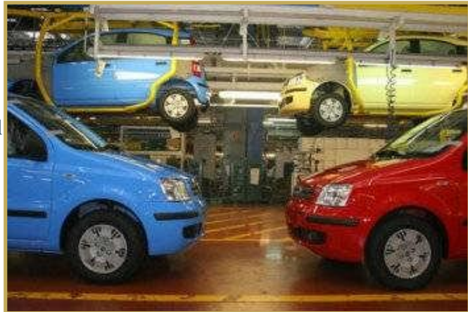
Low-cost, highly skilled labor is the major factor driving the automotive industry in Poland.

output, and specializes in the production of spare parts and accessories. The sector is also a magnet for global auto majors. Poland is luring these auto behemoths with low-cost, highly skilled labor, as well as a comprehensive network of subcontractors, many of them holding the highest certificates of quality.