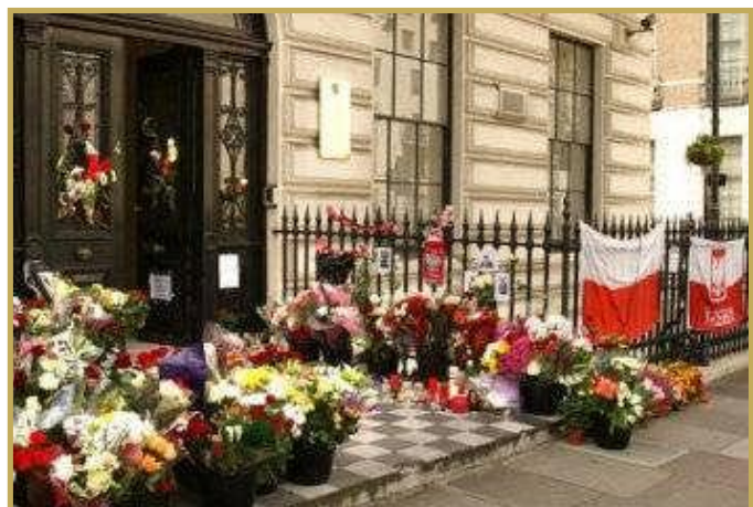
The plane crash which killed the Polish president and the country's top brass may mark a new beginning in the relationship between Poland and Russia.

According to reports from Reuters, the center-right Polish government has also made good progress in improving bilateral ties with neighbors. Russia is a case in point. The decades-old frosty bilateral ties between Poland and Russia date back to the Katyn massacre of 1940 in which some 22,000 Polish officers were killed under the orders of Josef Stalin. However, the strained relationship between the two countries seems to show signs of thawing in the aftermath of the April 2010 plane crash in Russia in which most of Poland's